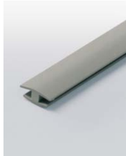
H joining profile