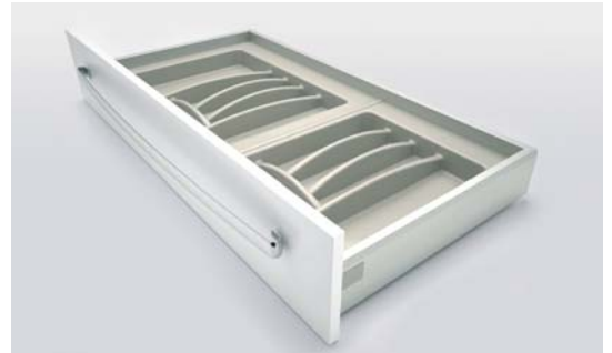
Application Tetrix cutlery tray